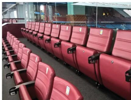
Ferco ARC Max – Villa Park