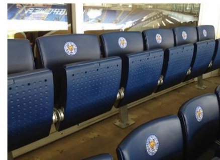
Ferco ARC One – King Power Stadium