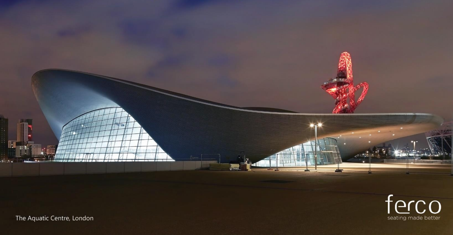
The Aquatic Centre, London