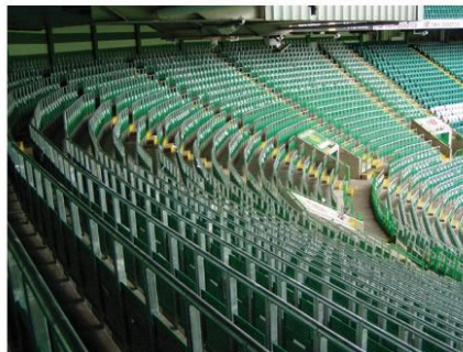
Ferco RailSeat - Celtic Park